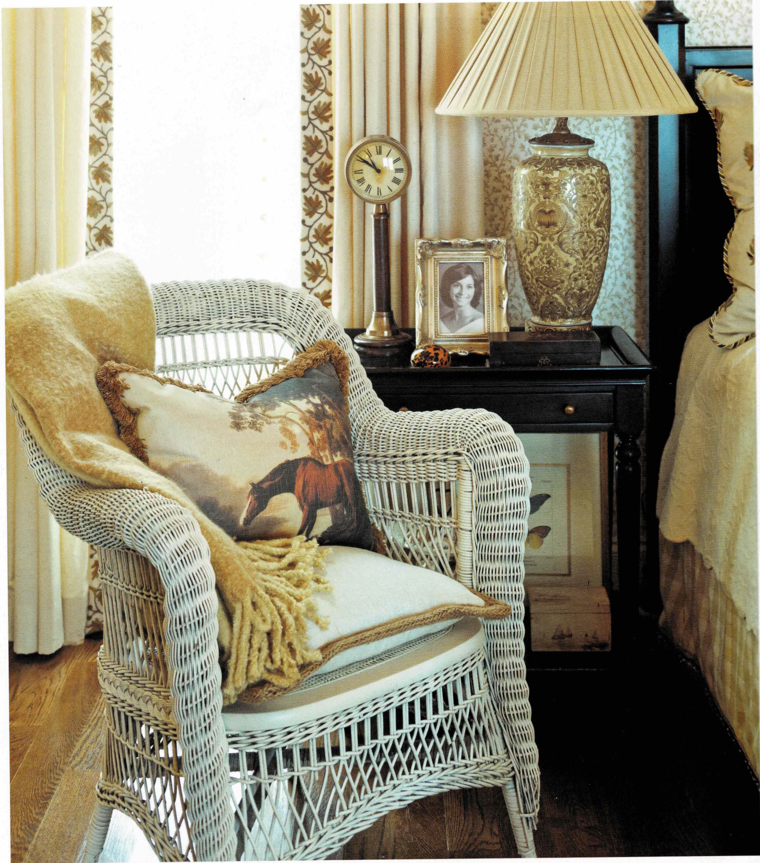
Accumulated over the years, beautiful antiques and decorations are given pride of place on a bedside table. A wicker armchair topped with an equestrian motif pillow reflects the homeowners' love of the bucolic vista outside their window. Gently echoing the bed skirt, a checked wallpaper was chosen for the adjoining master bath (opposite). Brushed brass fixtures and hardware along with a duo of dark framed mirrors strike a bold contrast with the tan-and-white scheme. A polished brick floor in a herringbone design infuses the space with texture and warmth.