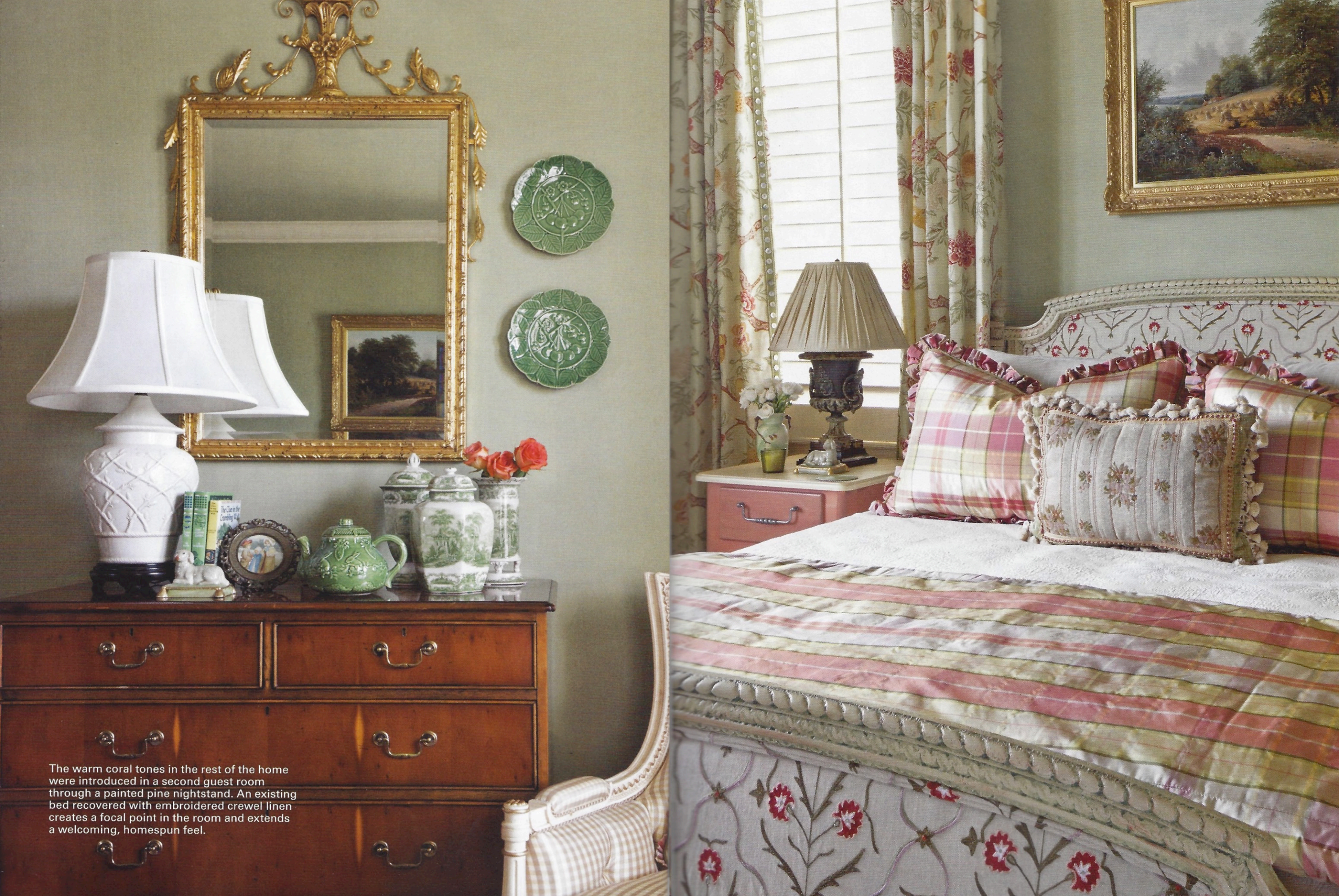
The warm coral tones in the rest of the home were introduced in a second guest room through a painted pine nightstand. An existing bed recovered with embroidered crewel linen creates a focal point in the room and extends a welcoming, homespun feel.